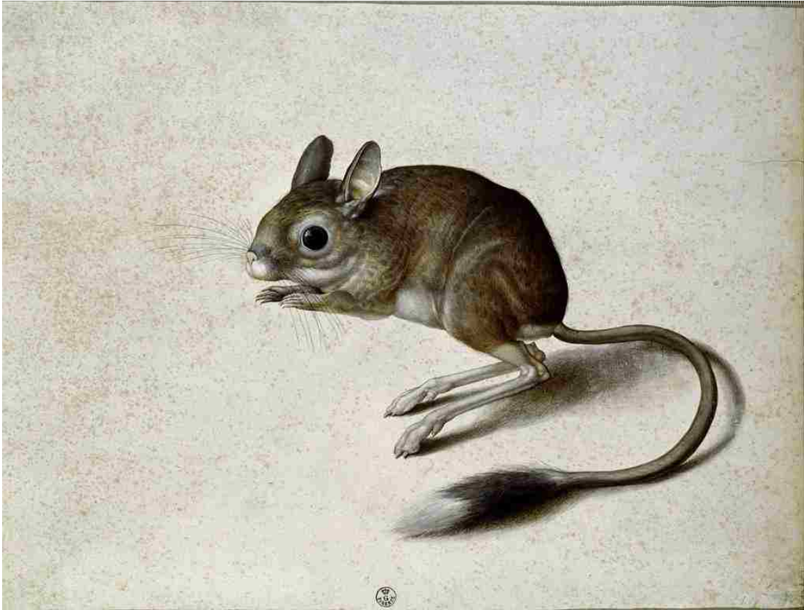
Figure 6. Jerboa ( Jaculus jaculus , 1577-1587, inv. 1959 O Firenze, Gabinetto dei Disegni e Stampe degli Uffizi).