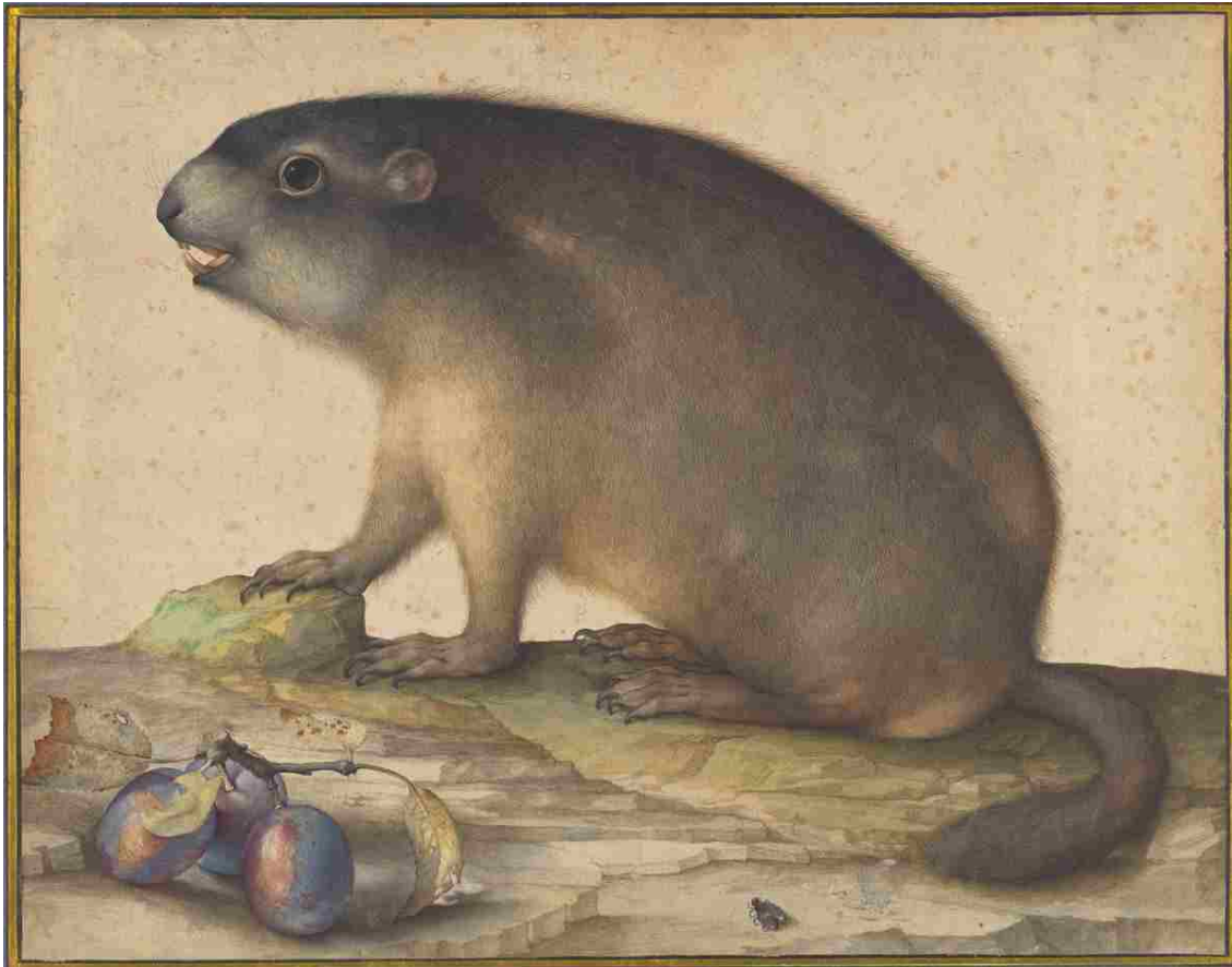
Figure 5. Marmot with a branch of plums , (inv. 2007.111.121, National Gallery of Art, Washington).