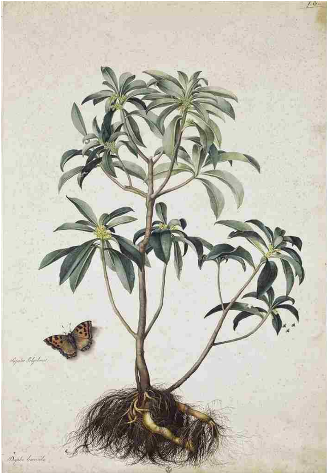
Figure 1. Daphne laureola (inv 1955 O, 67 x 46 cm, Gabinetto dei Disegni e delle Stampe degli Uffizi).