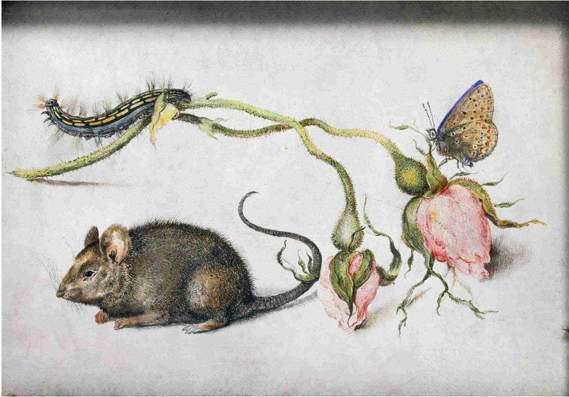
Figure 7. Jan Brueghel the Elder, Mouse with roses , 1605-11, oil on copper, 7.2 x 10.2 cm, inventory #72, Pinacoteca Ambrosiana, Milan.