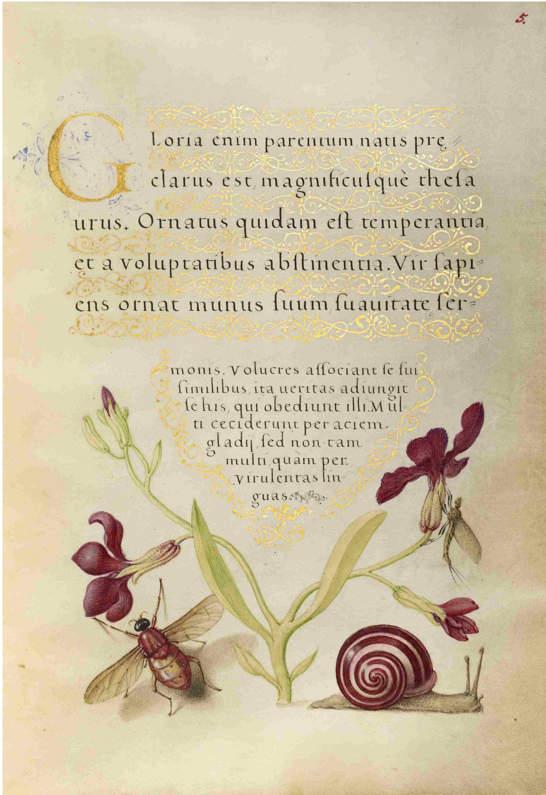
Figure 4. Joris Hoefnagel and Georg Bocskay, Gillyflower, Mayfly, and Snail, Bocskay's calligraphy: 1561-62, Hoefnagel's miniature work: 1591-1596, inv. Ms. 20, fol. 5, J. Paul Getty Museum, Los Angeles.